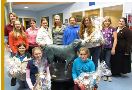
Hill Girl Scout Troop